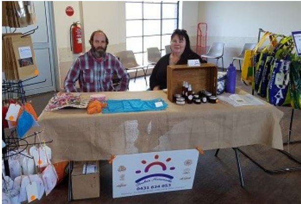
Porscha specialises in waxed and organic items.