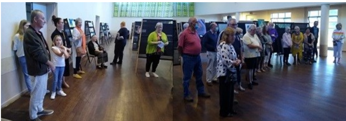
Some of those gathered at Opening Night.