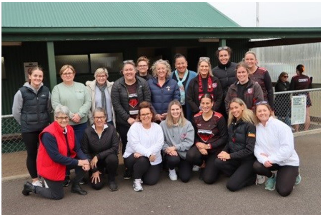
Past netball coaches.

Thanks to the Penshurst Football Netball Club for sponsoring these colour pages (2-4).