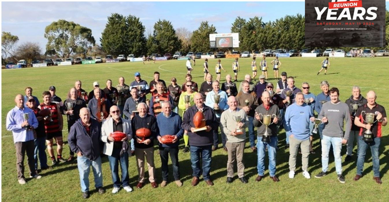
Group shot of representatives of the premierships.