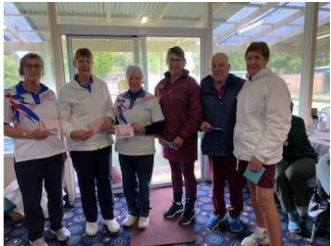
Winners and Runners Up

This is our only ladies tournament for the season and it turned out a beauty, thanks to all.